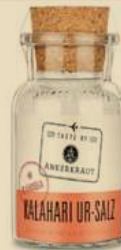
Kalahari Ur-Salz (Namibia)