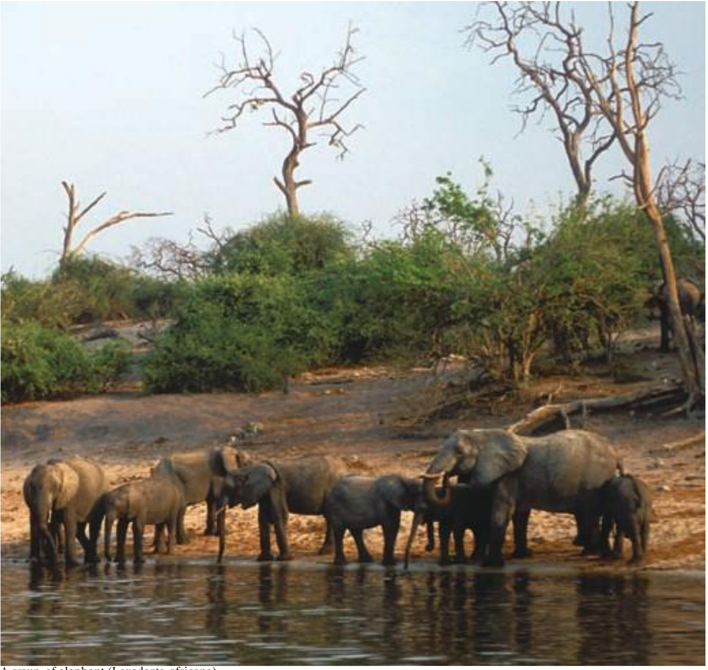
A group of elephant (Loxodonta africana)

Further campsites are to be developed at Mvubu, Balyerwa, Hippo Pool and Maziba.